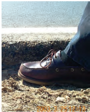
Sharp, steep pavement edge dropoffs can contribute to crashes.

A vehicle that has departed a paved surface can have difficulty re-entering the roadway if the pavement edge is vertical—especially if the edge